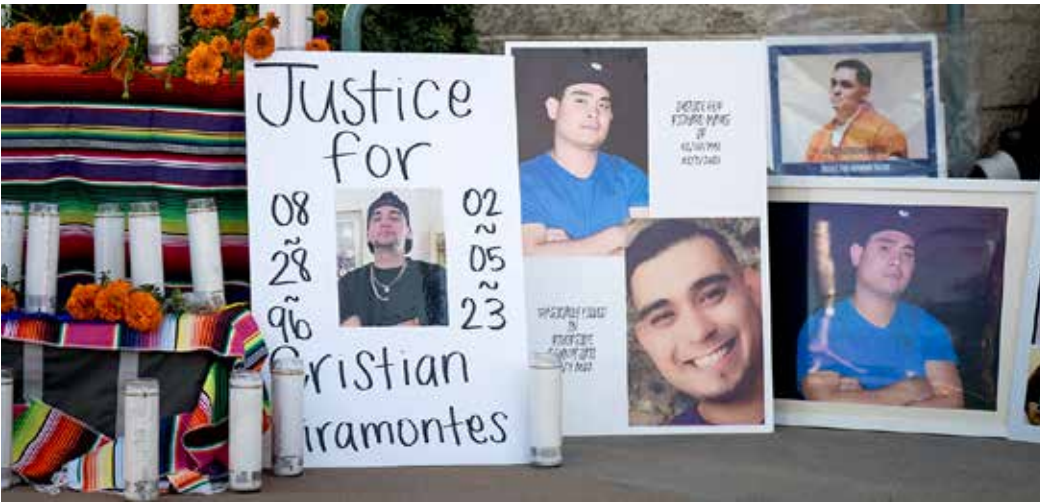
A Dia de los Muertos altar outside the John F. Tavaglione Executive Annex in Riverside county in honor of those killed in the custody of Riverside Sheriff's Department deputies, on Oct. 31, 2023.